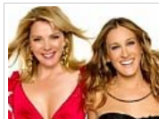
Check out where your childhood fav celebs are today...