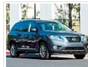
The midsize SUV segment offers a wide range of vehicles. See if your next car makes the grade.