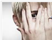
This new site makes it hard to hide your past from someone...