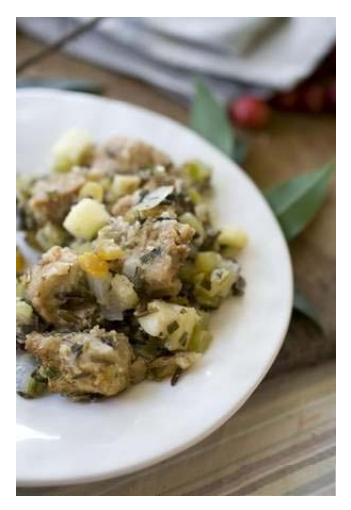
After settling on the base for your stuffing, go for the flair like this multigrain and wild rice stuffing with apples and herbs. Recipe

Written by Michele Kayal Associated Press FILED UNDER: Food